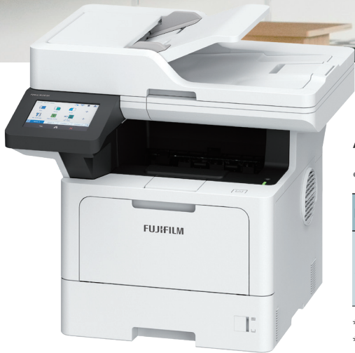
Apeos 4620 SX